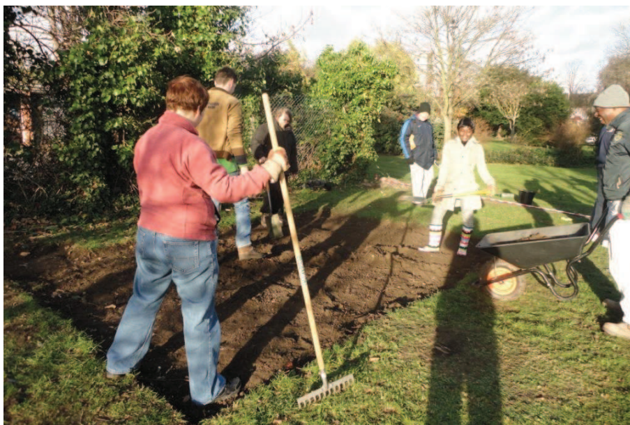
Constructing the foundations to the greenhouse

Work began in earnest in December to construct a Growing Area in an underused corner of the gardens. This fenced off area will contain all facilities necessary for the group to propagate their own plants to increase the diversity of planting, colour and interest in the gardens. This will also provide an important training tool for the volunteers both during construction, and through learning the appropriate plant propagation skills. The final four Penge Green Gym sessions of 2011, and one corporate team building day, have been dedicated to levelling and laying paved foundations to support a 12ft by 8ft polycarbonate greenhouse, as well as constructing half of the 6ft timber fence which will secure the area. This exciting project is being supported by the London Borough of Bromley.