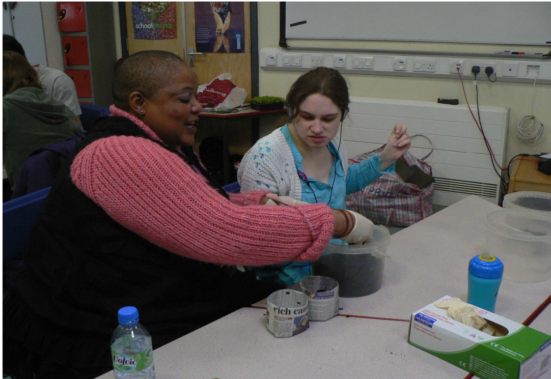
Local scout groups and Nash College have been helping by making their own pots and planting tree seeds ready for the nursery later in the season.