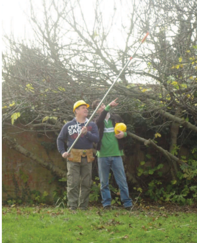
Pruning overhanging trees