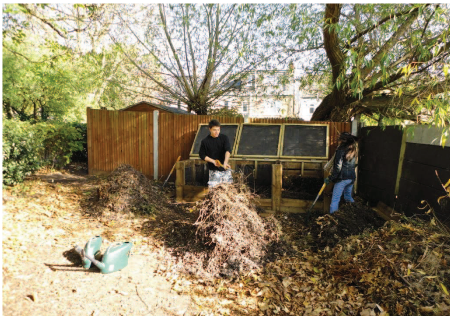
Turning the compost regularly speeds up the decomposition process

Five committed volunteers joined BTCV's Action for Croydon's Environment team for a day of willow coppicing at nearby Heaver's Meadow. The material collected at this additional session was recycled at Winsford Gardens where volunteers created rustic fences to discourage trampling of some of the most vulnerable ornamental beds.