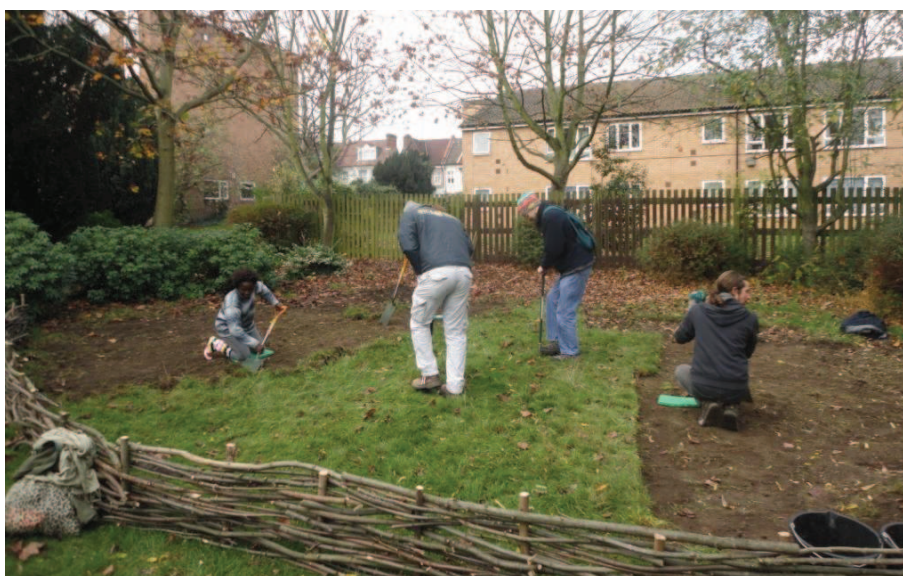
Penge Green Gym volunteers begin work on the second wildflower meadow

Rather than waste fallen autumn leaves, volunteers swept these up on a weekly basis, storing them for use next spring once it has broken down into rich crumbly mulch. Turning the compost in the bins to speed up the decomposition process has also become a regular task. Unfortunately anti-social behaviour reared its ugly head again in Winsford Gardens when youths were spotted using compost bins built earlier in the year to climb fences into neighbouring gardens. Urgent action was taken by volunteers to move the compost bins to a new location, reducing this risk to the neighbours. The determined volunteers dismantled the bins, successfully saving all the materials, before re-erecting them in the new position.