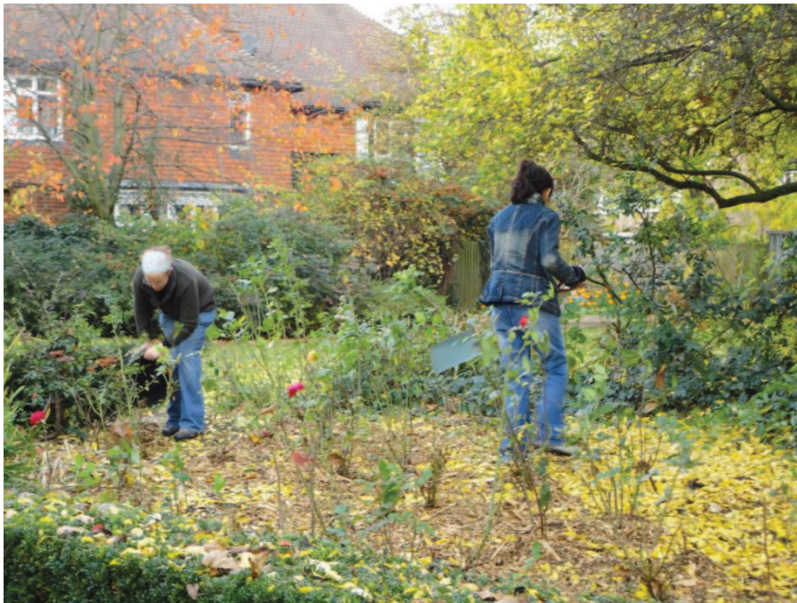
Working in the rose beds surrounded by spectacular autumn colours

Work to maintain the ornamental and vegetable beds has been continued on a weekly basis through weeding, edging the lawn borders, removal of self-seeding saplings, and pruning the shrubs and rose bushes. To protect the ornamental beds over winter volunteers mulched the beds with a thick layer of compost and woodchip, which will also serve to improve the soil for spring planting. A strenuous but worthwhile task which was completed with enthusiasm in October was scarifying the lawns, removing thatch and moss, to improve them for recreational use next year.