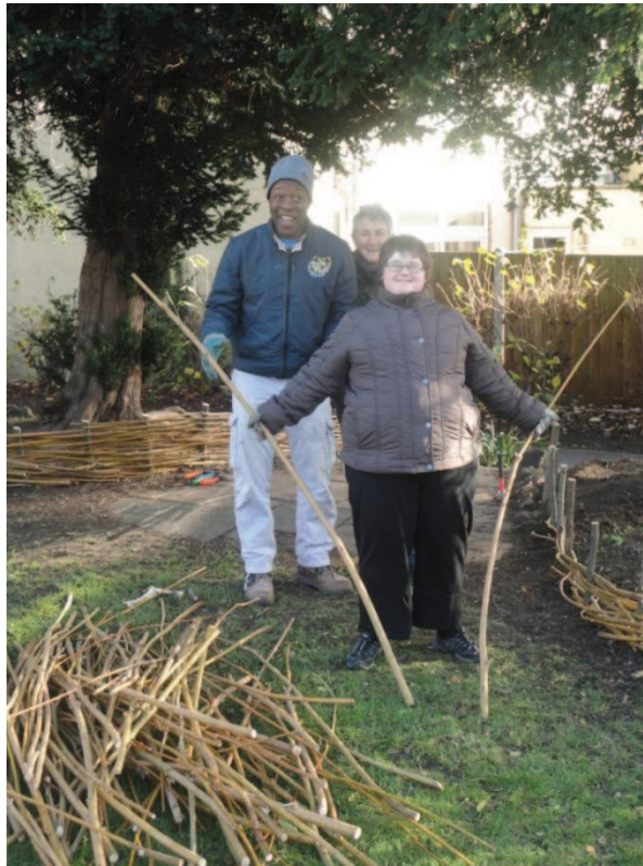
Constructing weaved willow fences to protect ornamental beds

With high numbers of volunteers attending each session and many new volunteers attending sessions through word-of-mouth, publicity has been stepped back this quarter and was primarily based on posting events on the standard websites. However, one notable publicity event was BTCV's national Big Green Weekend event, where Penge Green Gym was promoted at the successful regional event in Regent's Park.